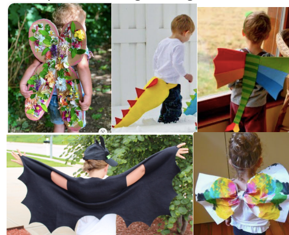
Make your own dragon wings and tail

Have you got any bubble wrap from your deliveries? Use it to make a bubble wrap dragon mask