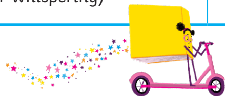
Illustration Allen Fatimaharan