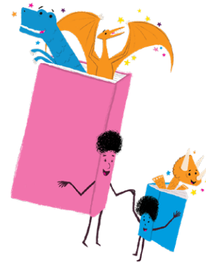
Illustration Allen Fatimaharan