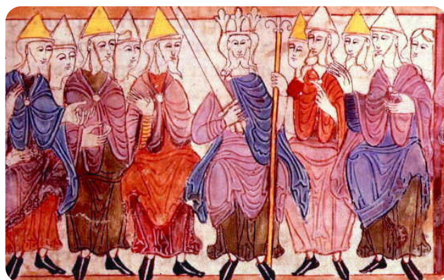
Anglo-Saxon king surrounded by his advisors known as witan