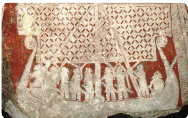
Stone decorated with an image of Vikings on a longship