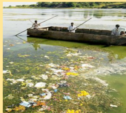
Litter and pollution can look unappealing and cause rivers to smell.