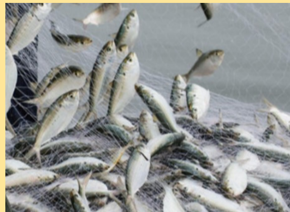
Overfishing can effect food chains.