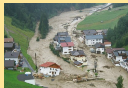
Built up areas can cause flooding.