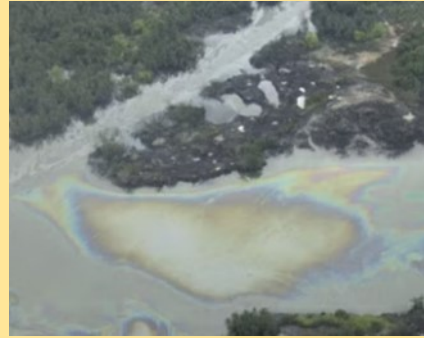
Oil spills Pollute.