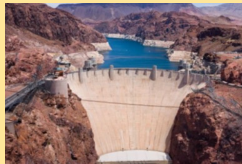
Dams obstruct Wildlife.