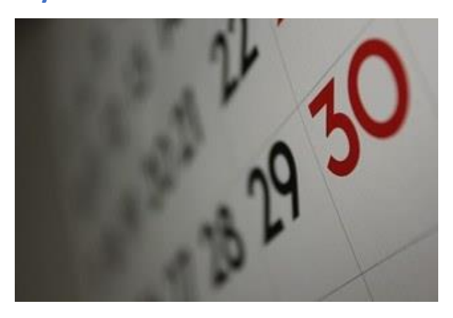
Friday 11th November- Halloween Themed School Dinner

Thursday 14th November- Year 4 Library Visit